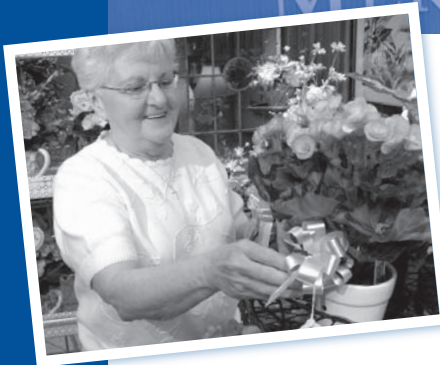
Volunteers staff the Mercy Heart Center information desk, the Mercy Gift Shop (left) and a Senior Friends event (bottom right).

Because Mercy associates have been an important part of the hospital's success, the Centennial Committee distributed a survey to gather associates feedback about commemorative activities. Associates are encouraged to share their ideas and opinions about proposed events.