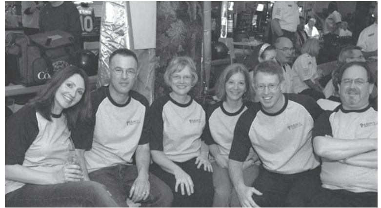
Mercy associates and their spouses support the Mercy Service League's bowling fundraiser, "Strike Up a Cure for Cancer."