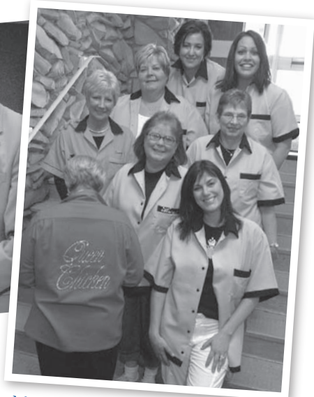
Members of the Service League Planning Committee display their bowling attire during the "Strike Up a Cure" fundraiser.