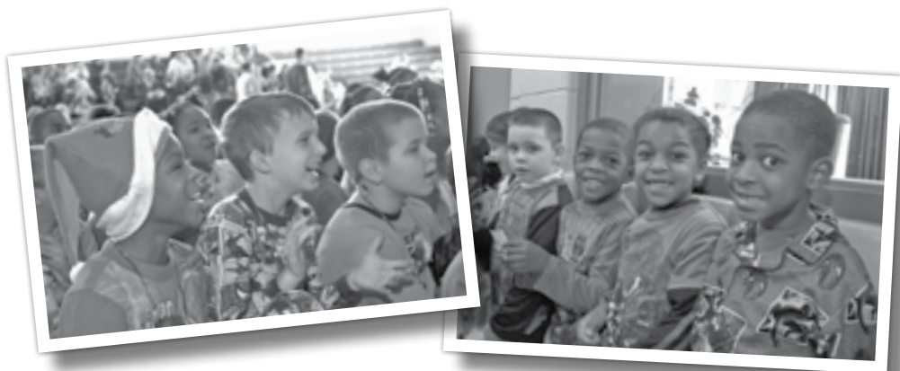
Compton Elementary students in Canton came to school dressed in their new pajamas for the Polar Express party. The sleepwear was donated by Mercy PALS, the Mercy Fitness Center, SWAN, Ronald McDonald Charities and Shared Blessings.

Other PALS activities at Allen and Compton include a monthly lunch and reading program, a children’s art gallery near Mercy’s main lobby, health screenings at parent-teacher conferences, healthy snacks during proficiency testing and an annual PALS Day with career exploration for older grades. Students also make meal tray favors for Mercy patients.