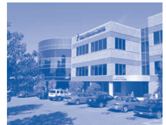
Mercy Medical Center today

On September. 24, 1908, the Sisters of Charity of St. Augustine opened an 18-bed hospital in the former home of President William McKinley. Named Mercy Hospital in honor of the founding Sisters who left France in 1851, the facility was "open to everyone, rich and poor alike, regardless of religious faith or nationality."