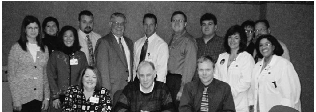
Mercy's multidisciplinary stroke committee makes strides in helping Mercy become a Primary Stroke Center.