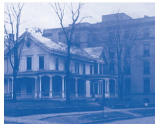
Mercy Hospital 1908