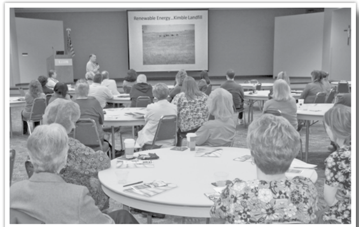
About 75 employees attended Mercy Green Team's first hospital-wide meeting in March.

Before the meeting ended, many offered additional green ideas – from reusable cups in the cafeteria to increased recycling awareness and efforts with main campus and off-site employees, patients, families and visitors. The green team plans to hold quarterly meetings; in the mean time, employees are invited to contact Campbell at ext. 6986 or Regula at ext. 1092 with additional input.