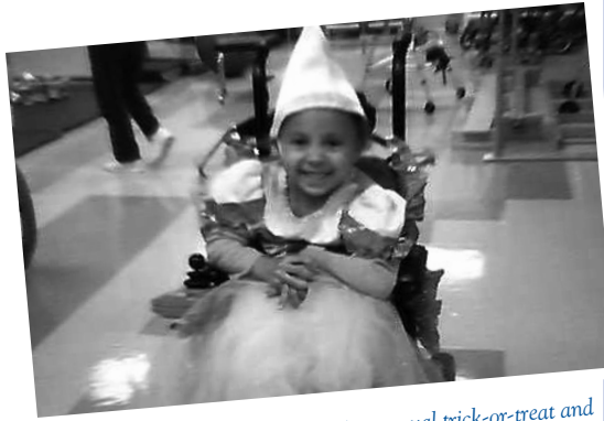
Mercy pediatric therapy patients enjoy annual trick-or-treat and Christmas parties at Mercy Health Center of North Canton.

Mercy pediatric therapy also sponsors a special trick-or-treat event for therapy patients every