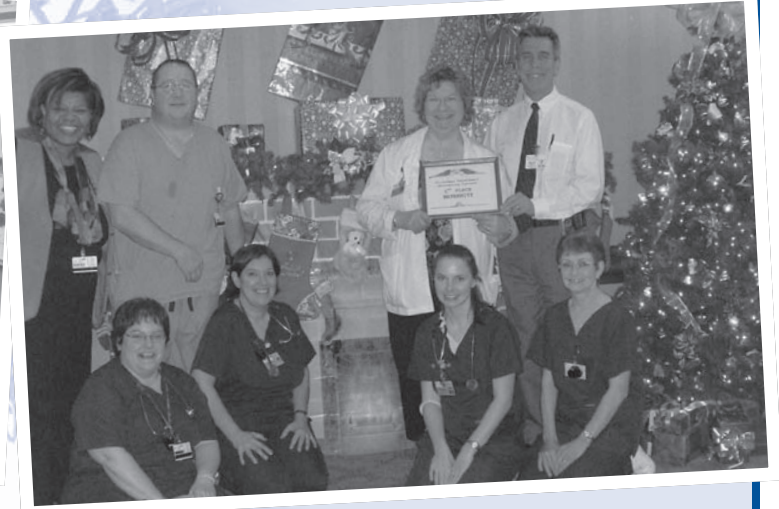
Associates got into the Christmas spirit during the department decorating contest. Judging took place Dec. 15, and Maternity Services took first place. The Cashier's Office was awarded second place, and Human Resources third. Thanks to everyone who helped make Mercy festive during the holiday season.