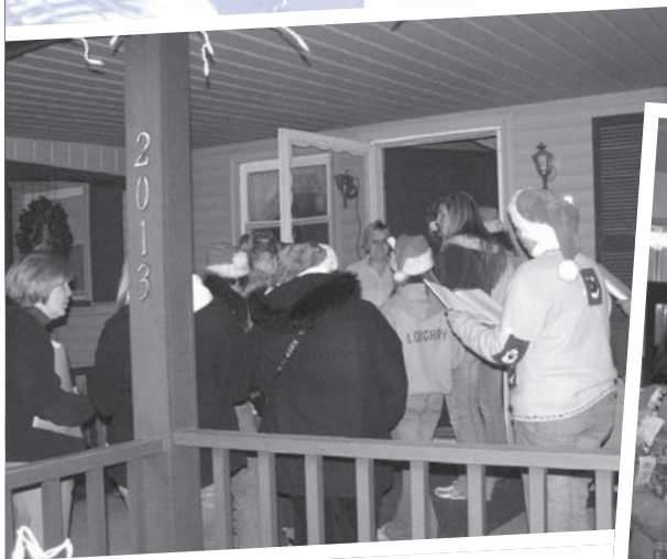
The staff and children of Mercy Homecare/Hospice brightened the spirits of several patients and families during their annual caroling event on Dec. 19.